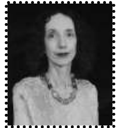
JOYCE CAROL OATES