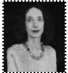
JOYCE CAROL OATES